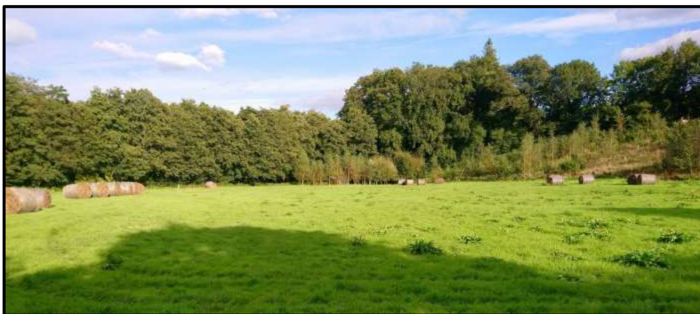
View of the Far Field (Zone H)