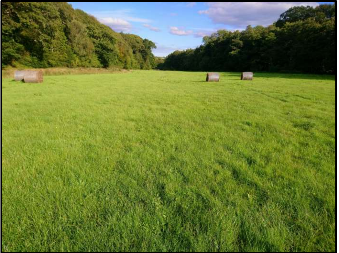
View of main field (Zone B) with recently baled hay