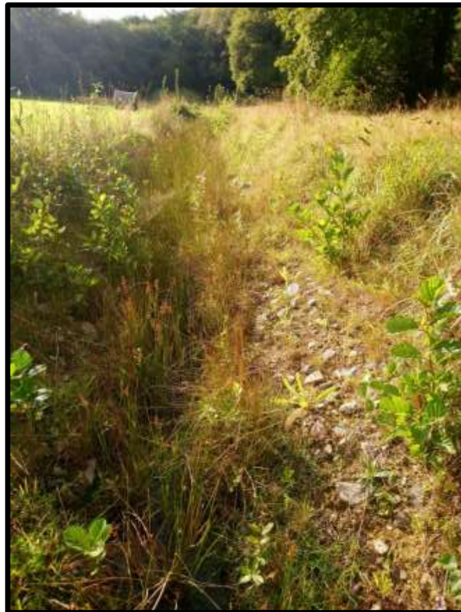
View of the drainage ditch (Zone D) when dry in summertime