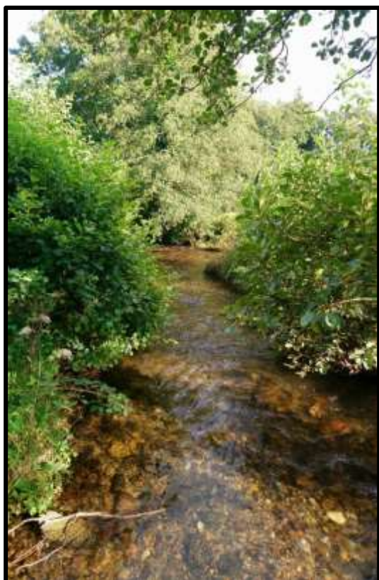
View of the stream (Zone F)