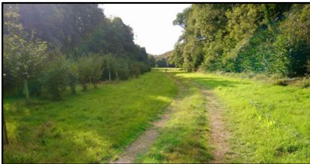
View of the First Field (Zone A)

The meadow areas are of low interest floristically, except around the edges, where a wider range of species are present including Rhinanthus minor (yellow rattle).