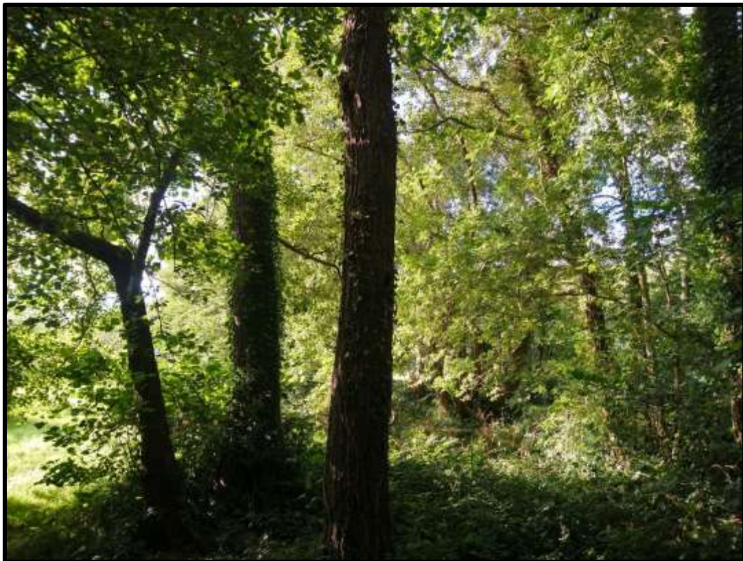
View of the woodland (Zone G)