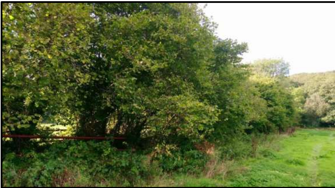
View of Hedge (Zone E5)