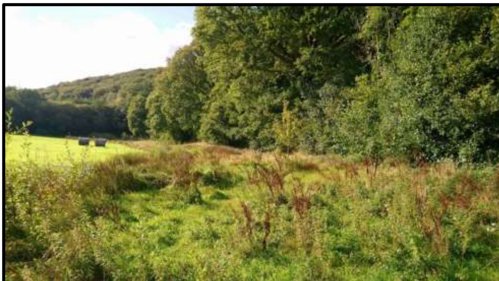
View of the Orchard (Zone C)